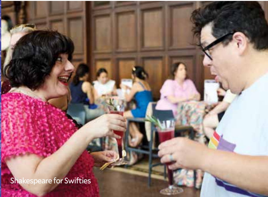
Shakespeare for Swifties