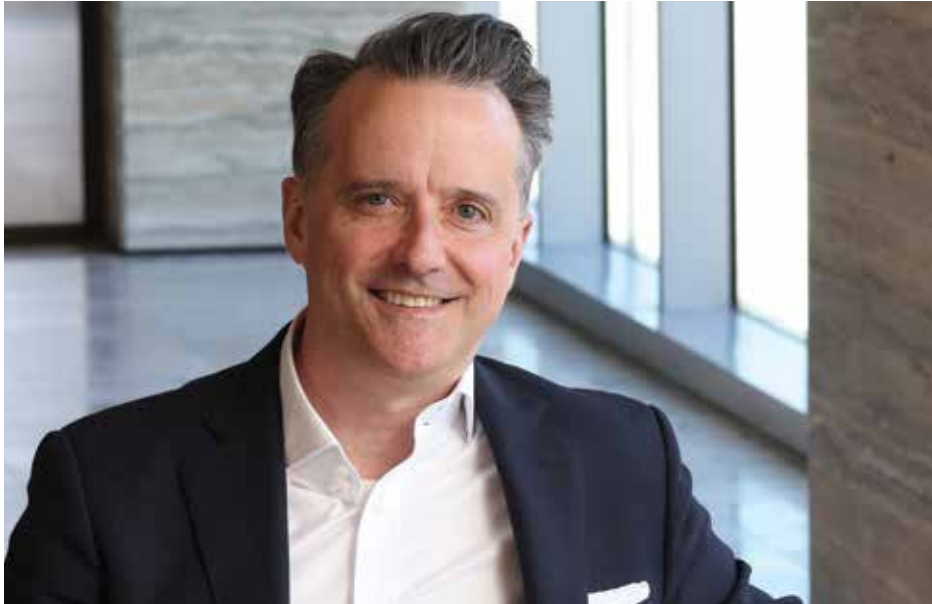
From the Board Chair