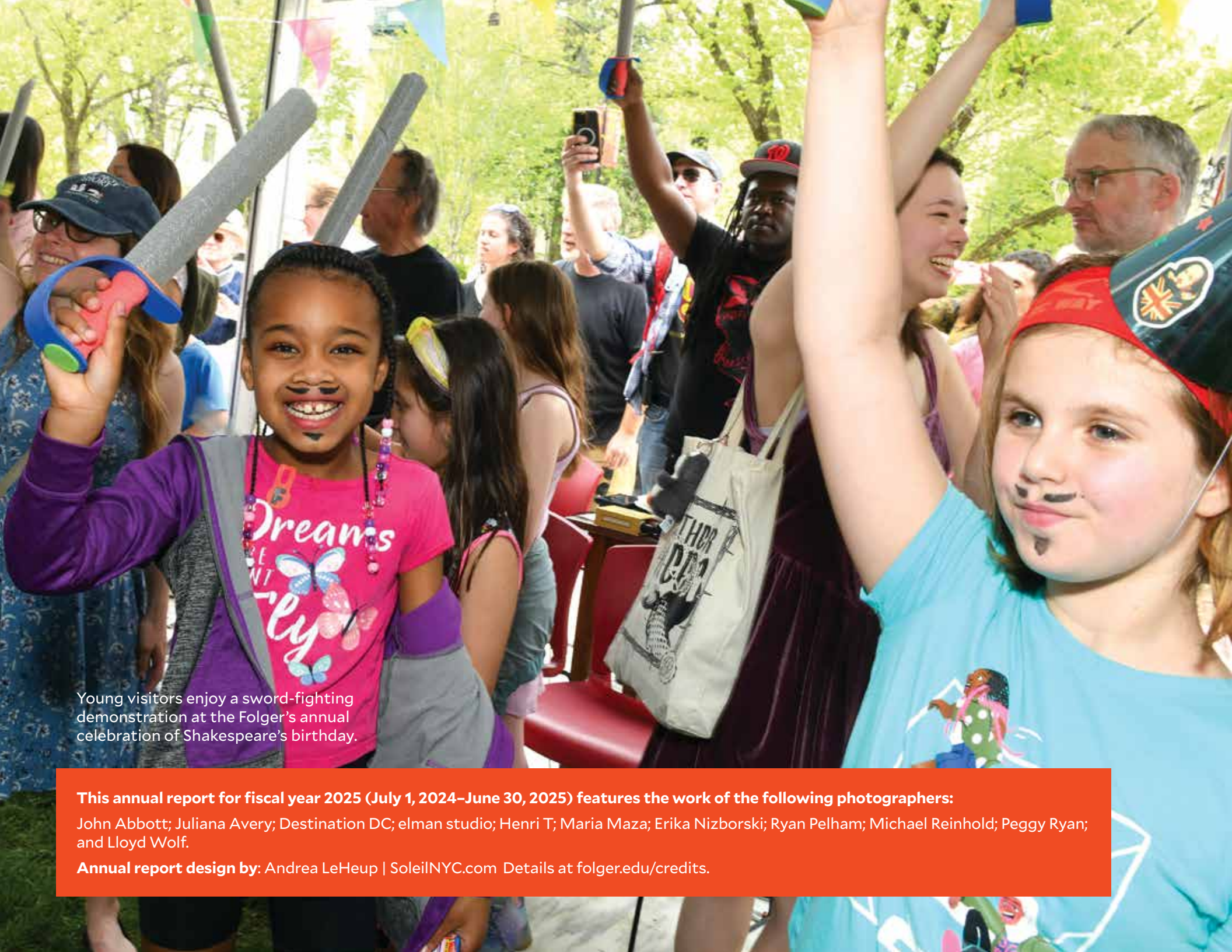
Young visitors enjoy a sword-fighting demonstration at the Folger's annual celebration of Shakespeare's birthday.

This annual report for fiscal year 2025 (July 1, 2024–June 30, 2025) features the work of the following photographers: