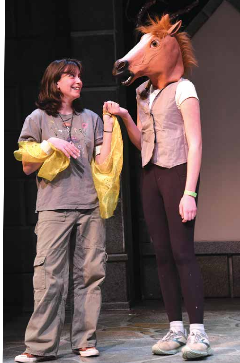
Student scenes at the Secondary School Shakespeare Festival. Opposite: Students enjoying Festival performances. More scenes from the Festival on page 23.