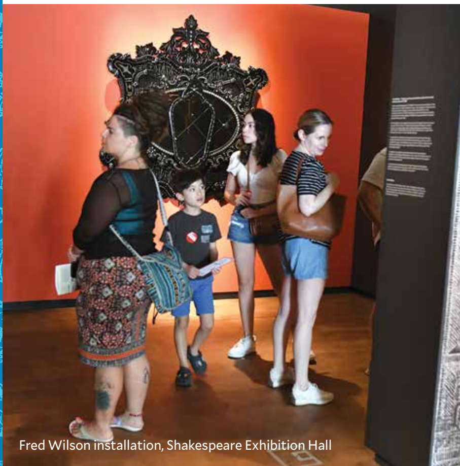
Fred Wilson installation, Shakespeare Exhibition Hall