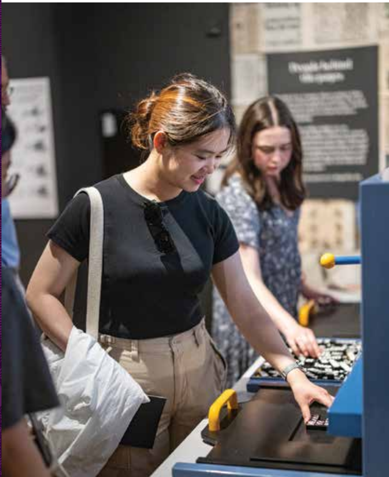
table in front of the case houses two open folios for visitors to inspect up close, along with touchscreens for exploring connections between the 82 copies. Lights inside the case illuminate the copies being explored on the screen. Other interactives allow visitors to search the folios as a detective, storyteller, or collector or to learn more about the book's history.